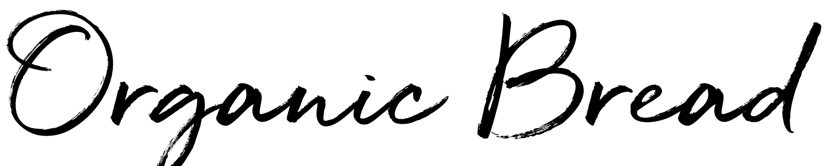
Served with our organic butter, organic jams & organic spreads.